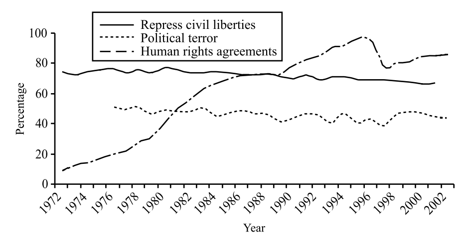
FIGURE 1. Human rights behaviors: Percentage of states that repress and that ratify human rights agreements

Noncompliance in the area of human rights—especially for the most egregious violations—can rarely be explained by bureaucratic failure. Human rights laws are not vague about prohibitions on torture or indiscriminate killing, and difficult social or economic changes take place inside states that do not repress their citizens. Human rights violations are by and large calculated acts taken by different actors that expect some form of gains from repression.